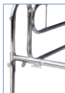
Detail of Spring-Loaded Siderail